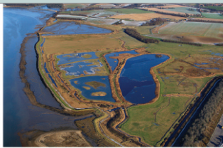
Trimley marshes reserve with Trimley village top right.