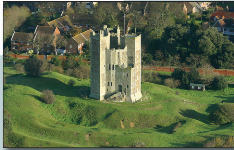
Right: Orford Castle.