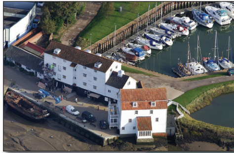
Middle right: Woodbridge tide mill.