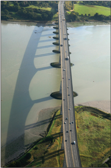
Above: The Orwell bridge.