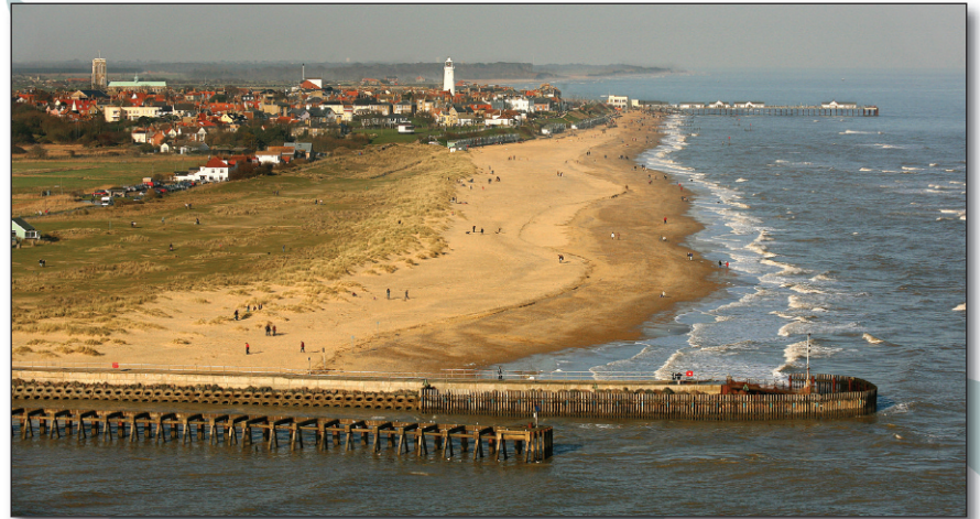
Southwold looking north.