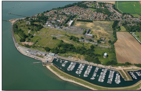
Above right: Shotley peninsula.