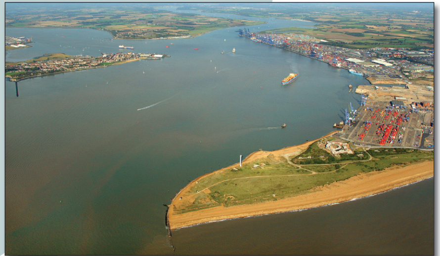
Harwich and the River Stour on the left. Felixstowe and the River Orwell to the right.